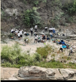
ROCK CLIMBING AREA