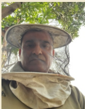
HONEY QUEEN WITH THE WORKER BEES