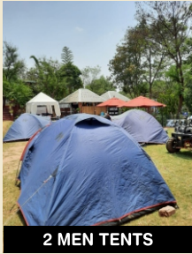
2 MEN TENTS