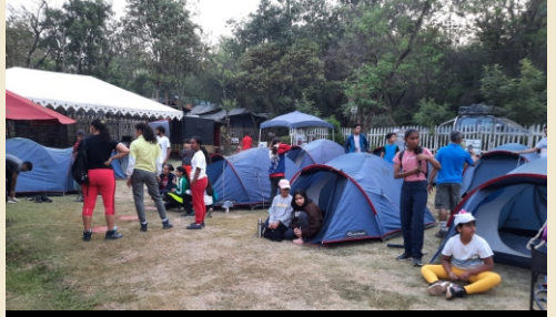
NIGHT OUT CAMPING